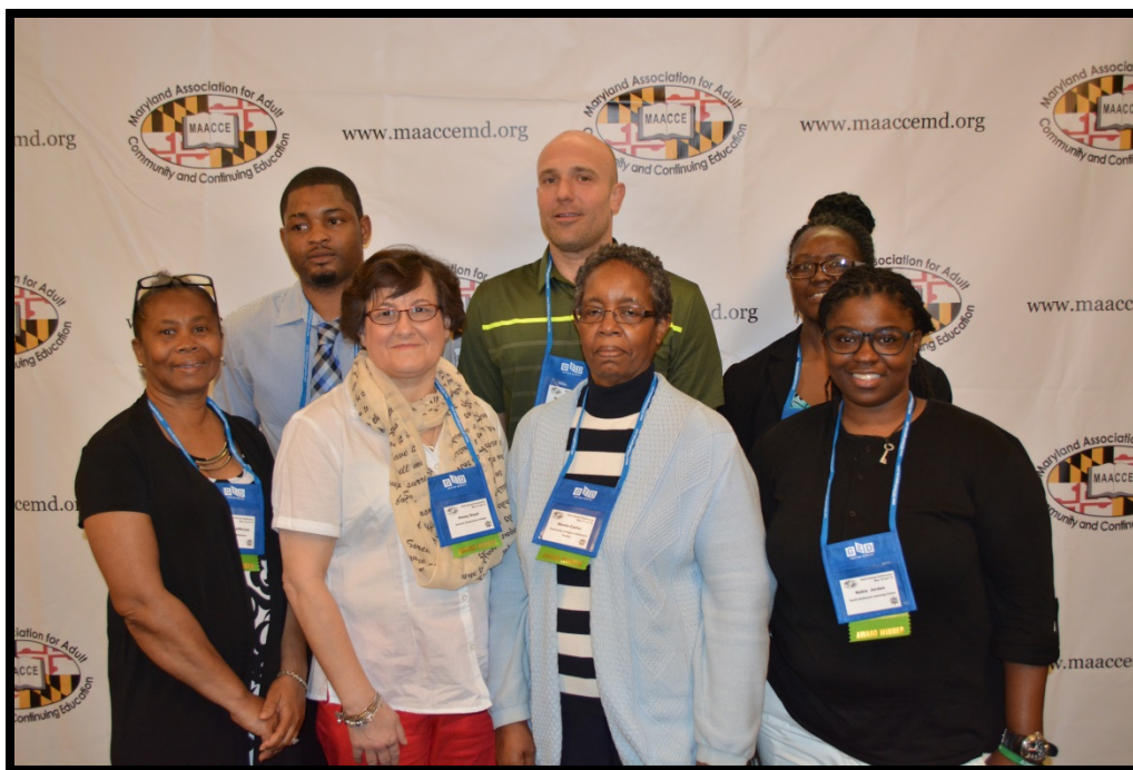
Student/Volunteer Award Winners